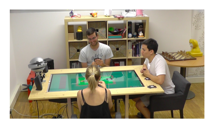
\textbf{Fig. 1} \ \ \text{Experimental setting for Study 1}.

We recruited a total of 30 university students (17 males and 13 females) with ages ranging from 19 to 42 years old ( M=23.03;\,SD=4.21 ). Among the participants, 56.7% had a high level of expertise in the game, 40% had a moderate level of expertise, and only 3.3% had never played the game before. Regarding previous interactions with the EMYS, 24 participants had previously interacted with it, and 6 were interacting with it for the first time.