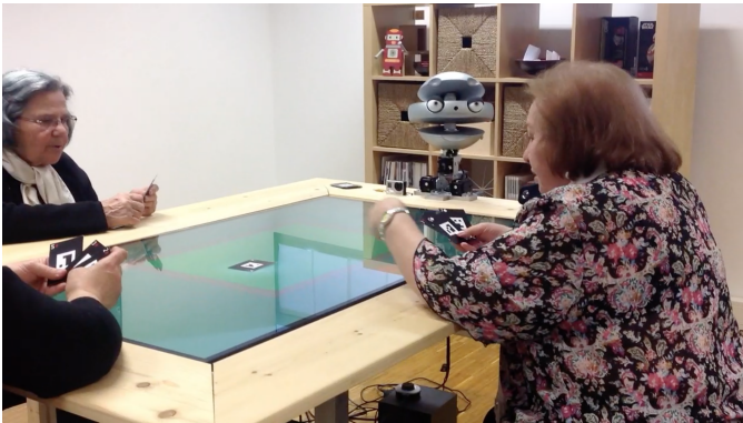
Fig. 2. Participants playing the card game of SUECA with the social robotic player.

A total of six elderly (3 female) recruited from a day-home care institution played the SUECA card game in a Lab (see Figure 2). They were instructed to play as many games as they wanted and at the end of the study two researchers performed a semi-structured interview focusing two main points: experience of playing (e.g. How was the game? What did you think of this new way of playing? Was there anything strange that did not go so well?); and the robotic game player (e.g. What was it like playing with the robot? Did you feel it was good at the rules of the game? Do you think it should learn some rules better?).